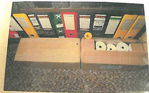
Bild 9 - Spurenlage Blutspitzen auf einem Karton vor dem Wandregal in Richtung Eingangstüre. (Spur 6)

Bild 1 - Spurenlage Ansicht von Büro im 1. Stock, aufgenommen von Eingang in den Raum. Bemerkenswert ist die Spurenlage in diesem Raum. (1) -> Blutspitze (Einblutung) am Teppich, unmittelbar vor dem Schreibtisch. (2) -> Blutspitze an der Wand und am Bürostuhl, rechts neben dem Schreibtisch bis in eine Höhe von ca. 130 cm. (3) -> Blutspitze, die hier die Blutspitze von oben nach unten verläuft aufgetragen wurden. (4) -> Blutverschmierung an der Toten des PC. (5) -> Blutverschmierung am Schreibtisch, sowie Blutspitzen am Fuß der Schreibtischkante. (6) -> Blutspitzen auf einem Pappekarton unter dem Schreibtisch. (7) -> Blutspitzen auf einem Karton in Richtung Eingangstüre.