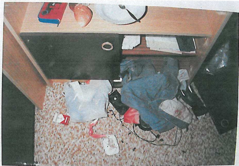
18 BILD 24 - Urspr. Lage 19 Nochmalige Aufnahme von blutverschmierter Kleidung vor dem Wandschrank im 20 Zimmer des Kofler Martin -(separate Auflistung der Sachen)-

1 bag, part of which is closed inside the cupboard door. This strongly 2 suggests that the belt was somehow removed from Mrs. Foeger's blouse 3 prior to the time that she started to bleed substantially from the stab 4 wounds sustained to her torso. The belt was then subsequently placed 5 partially into the plastic bag, and then the plastic bag containing the belt 6 was somehow moved into Mr. Kofler's bedroom where it was later 7 recovered.